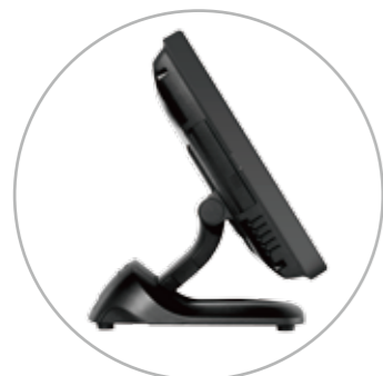
Full Extended Mode

The XT-6015C provides the selection of two foldable bases, the curvy slim GEN7E base and the larger but practical GEN8E base. The foldable base can be configured into "Flat Folded Mode" to save the shipping package volume, "Low Profile Mode" to allow greater interaction between the cashier and the customer, and the traditional "Full Extended Mode". All this can be achieved with a simple pull of the hidden lever.