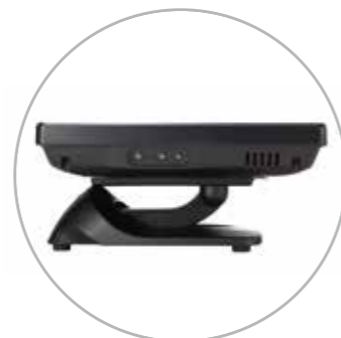
Flat Folded Mode