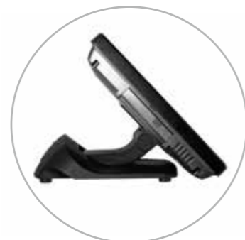
Low Profile Mode